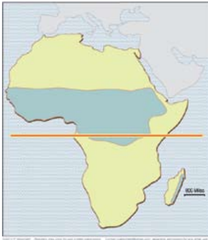
Abundant rainfall in summer