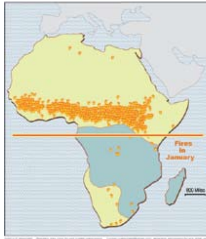
Winter rain and wildfires