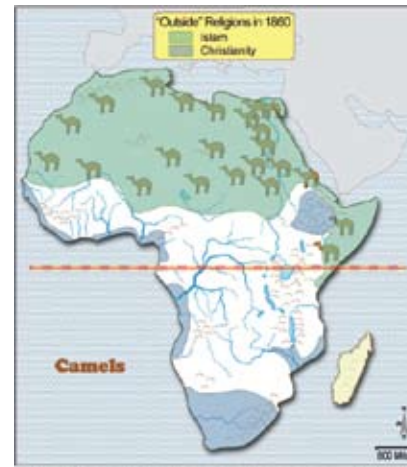
Camels and religions in 1800s

Grain crops and ancient capitals (for perspective, add rain, malaria, trade routes, ...)